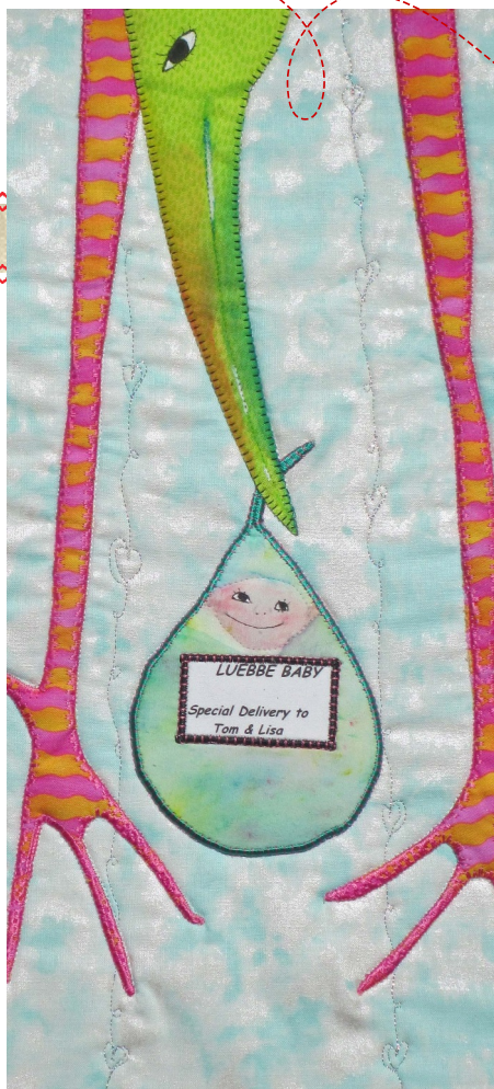
Created by Diane Gloystein